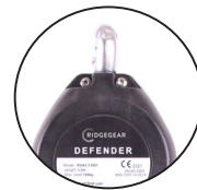
Top swivel for additional connection